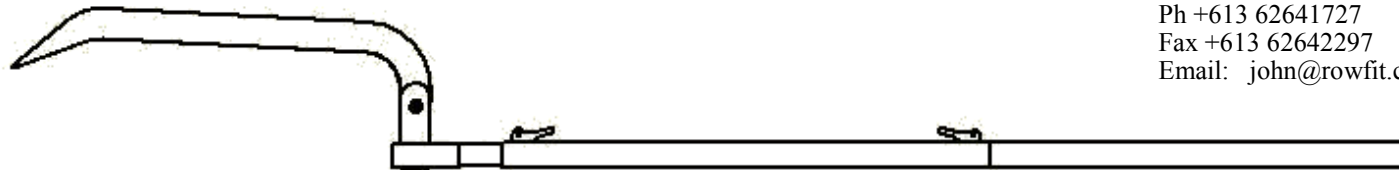
Height Stick Assembled

Manufactured by Rowfit International 2800 Huon Hwy Huonville Tasmania 7109 Ph +613 62641727 Fax +613 62642297 Email: john@rowfit.com Skype: john.driessen4